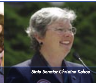
State Senator Christine Kehoe